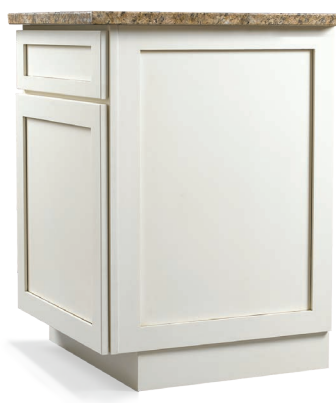
False Door Side