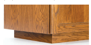
Side Toe Space