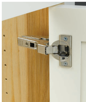
Blum Inset Hinge