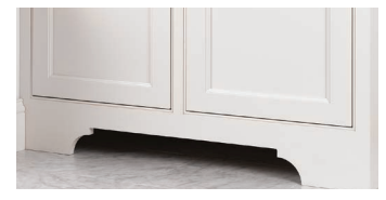
Shaped Bottom Rail (Shaped side also available)