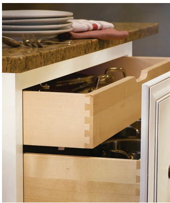
Drawer Box upgrades