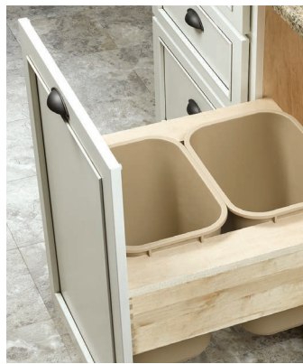
Trash Can Pull-Out